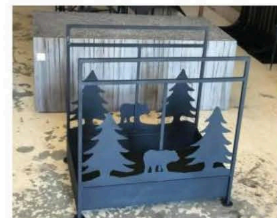
The Smithy now specializes in everything from fireplace doors and screens to chandeliers, railings, ornate metal gateways and even dock ladders.

Plasma cutters and electric hammers also help to make the work much more efficient and effective. Nonetheless, the work of the blacksmith remains essentially the same as it did originally- metal is heated and manipulated to create new strong and useful products.